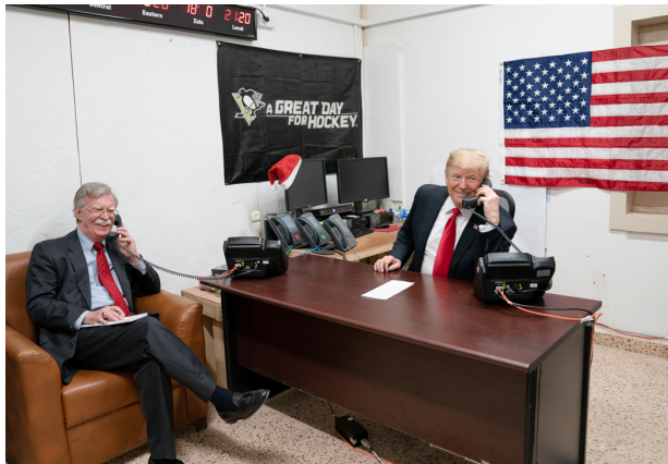
Trump speaks by phone with Iraqi Prime Minister Adil Abdul-Mahdi from Al-Asad air base in Iraq on December 26, 2018, after Abdul-Mahdi decided not to meet with Trump at the base.