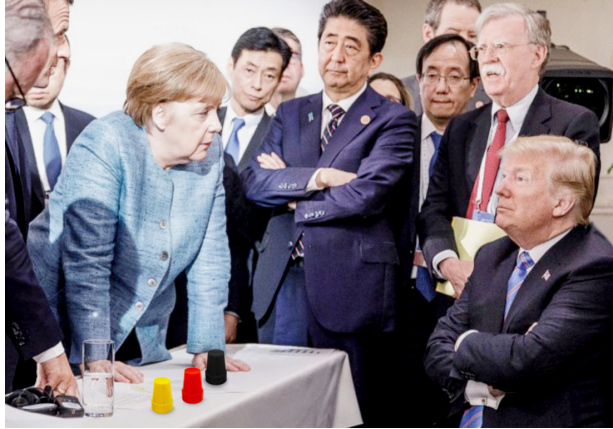
At the G7 meeting in Canada on June 10, 2018, I was there as the Europeans pushed Trump into a corner, literally. It turned out not to be a good moment for the Western alliance.