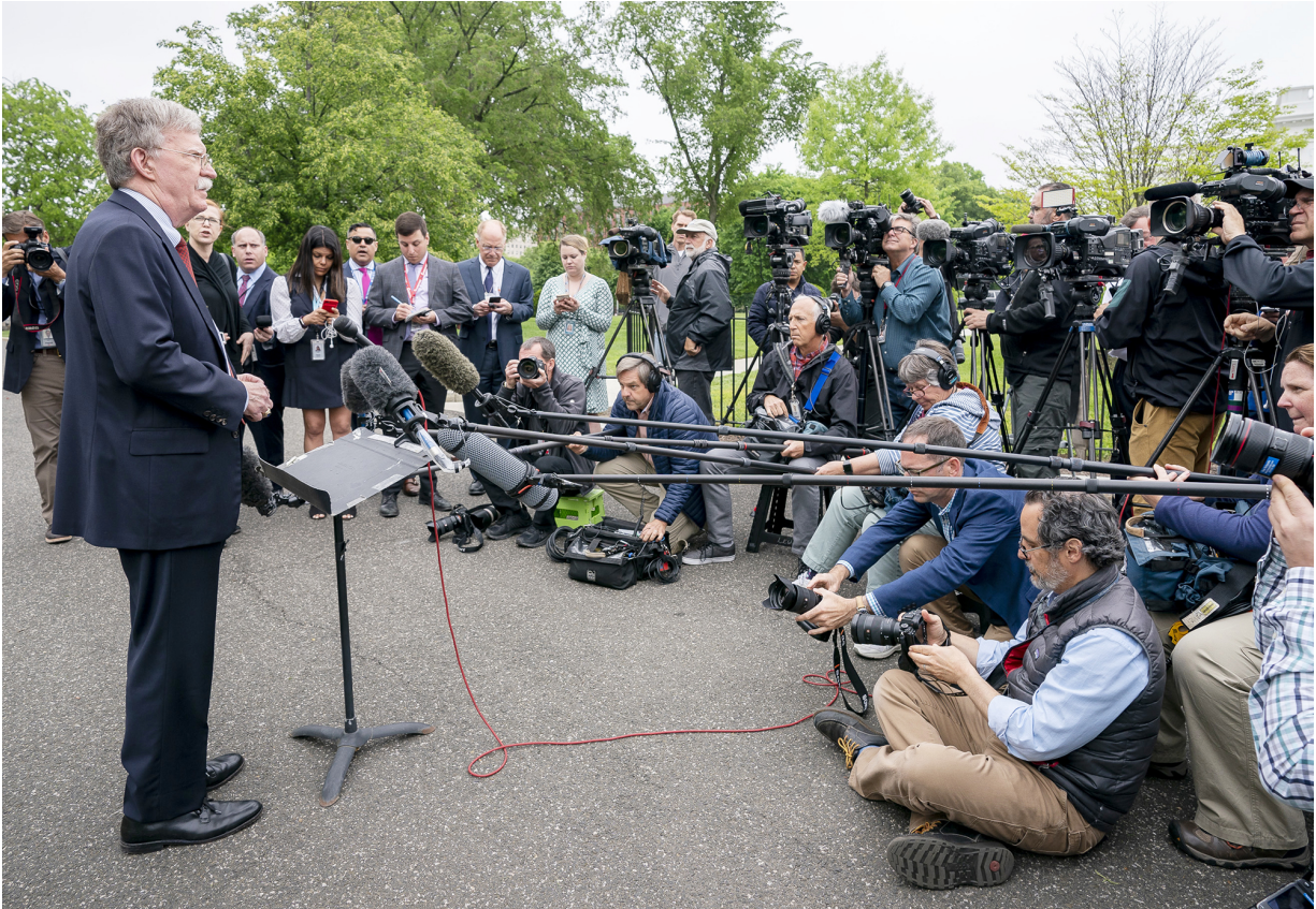
After a sad day for the people of Venezuela, I explained to the press outside the West Wing on May 1, 2019, how close the opposition to the Maduro regime had had come to ousting him.