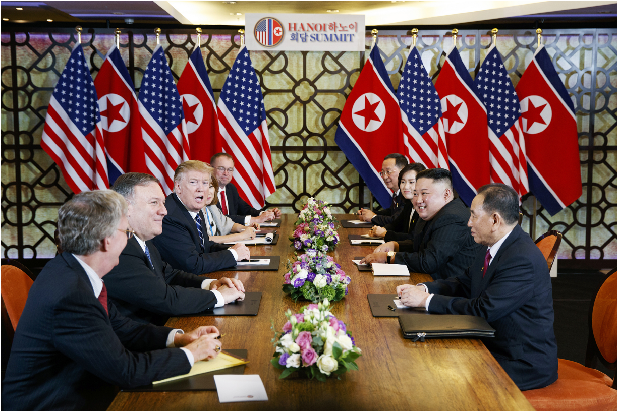
The final meeting of the Hanoi Summit between the United States and North Korea, February 28, 2019, from which Trump walked away without a deal.