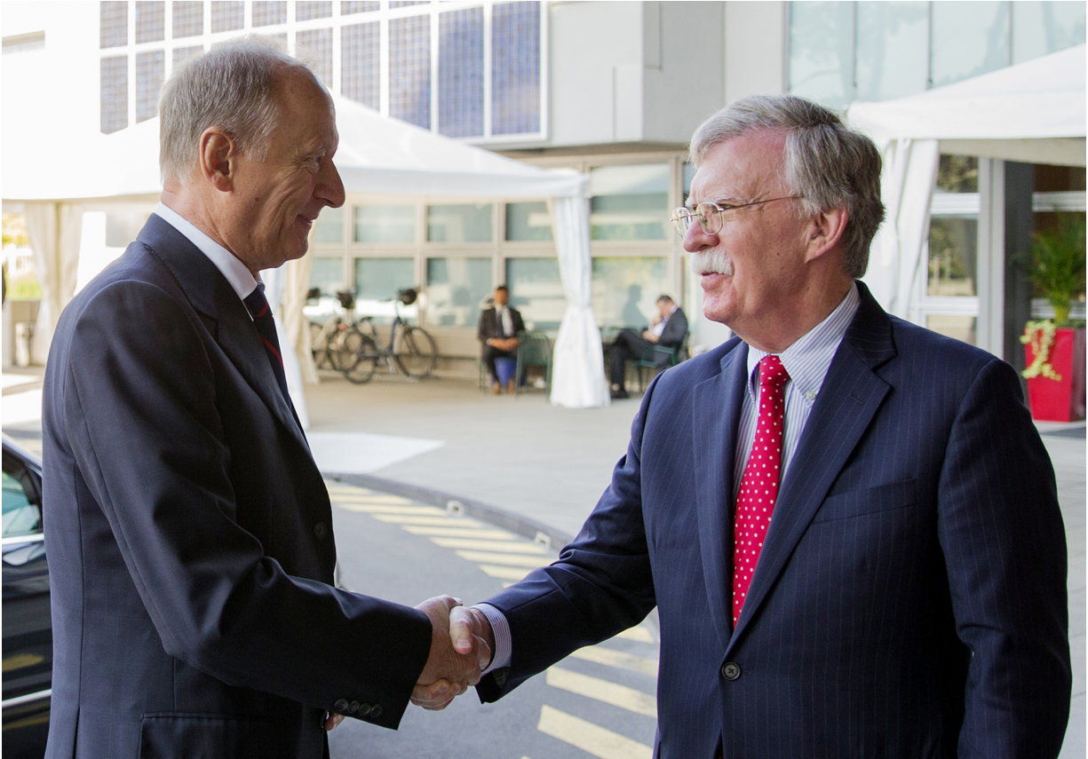
I met Nicolas Patrushev, my Russian counterpart, for the first time, at the US mission in Geneva on August 23, 2018, and made a point of addressing Russian election interference.