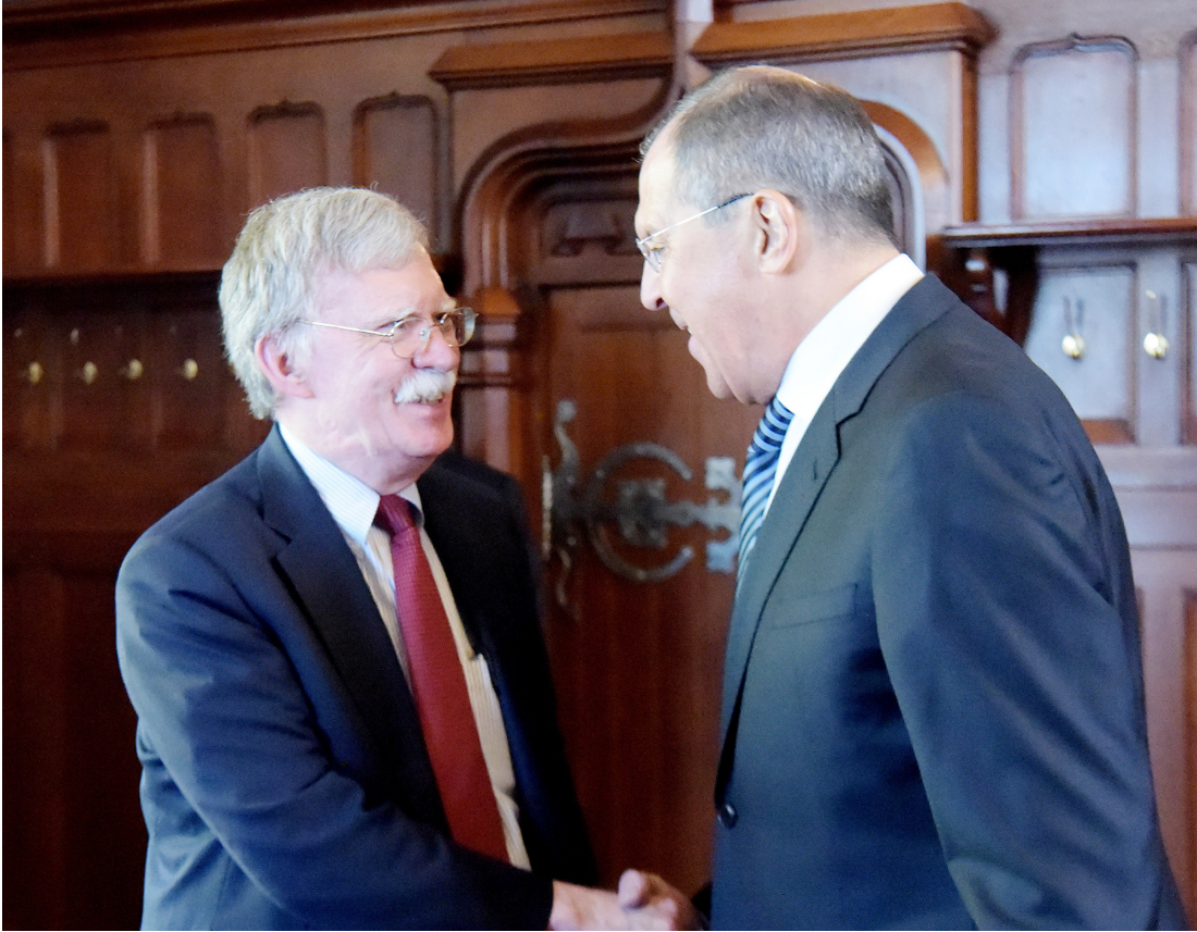
Getting together with Russian Foreign Minister Sergei Lavrov for lunch at Osobnyak House in Moscow on June 27, 2018, to prepare for the Trump-Putin meeting in Helsinki. Unfortunately, the summit ended in disarray when Trump appeared to cast doubt on US intelligence about Russian interference in our elections.