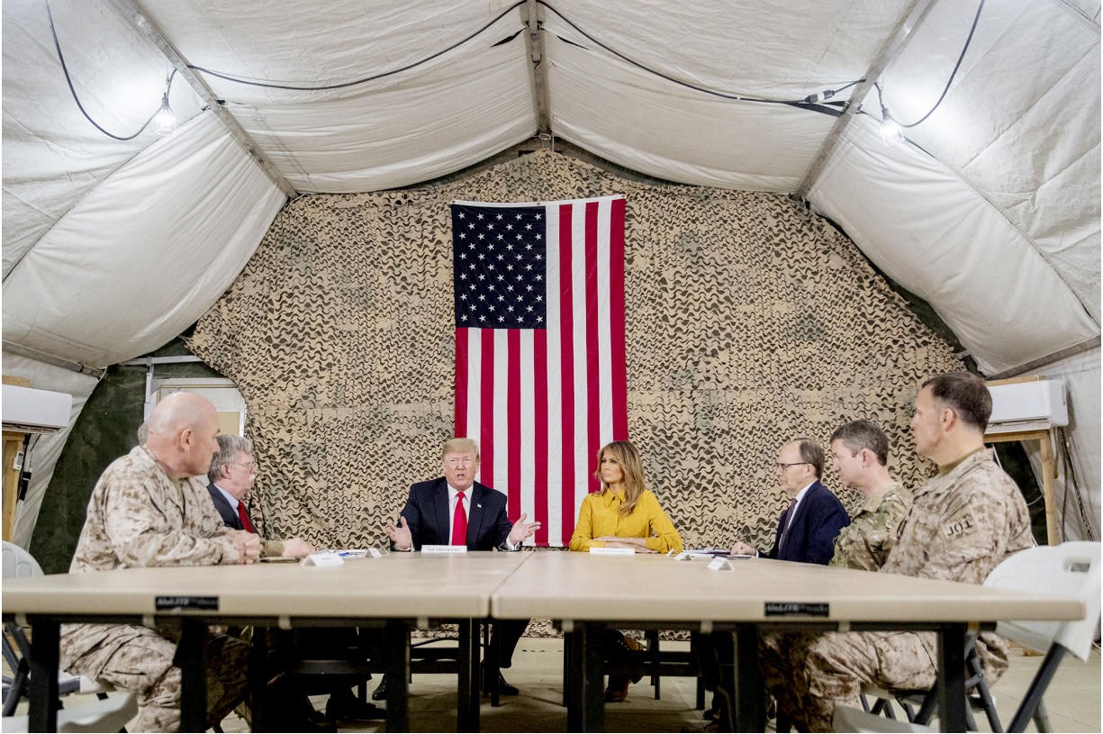
One of the turning points in Trump's decision making on Syria: being briefed by American military commanders at the Al-Asad air base in Iraq, December 26, 2018.