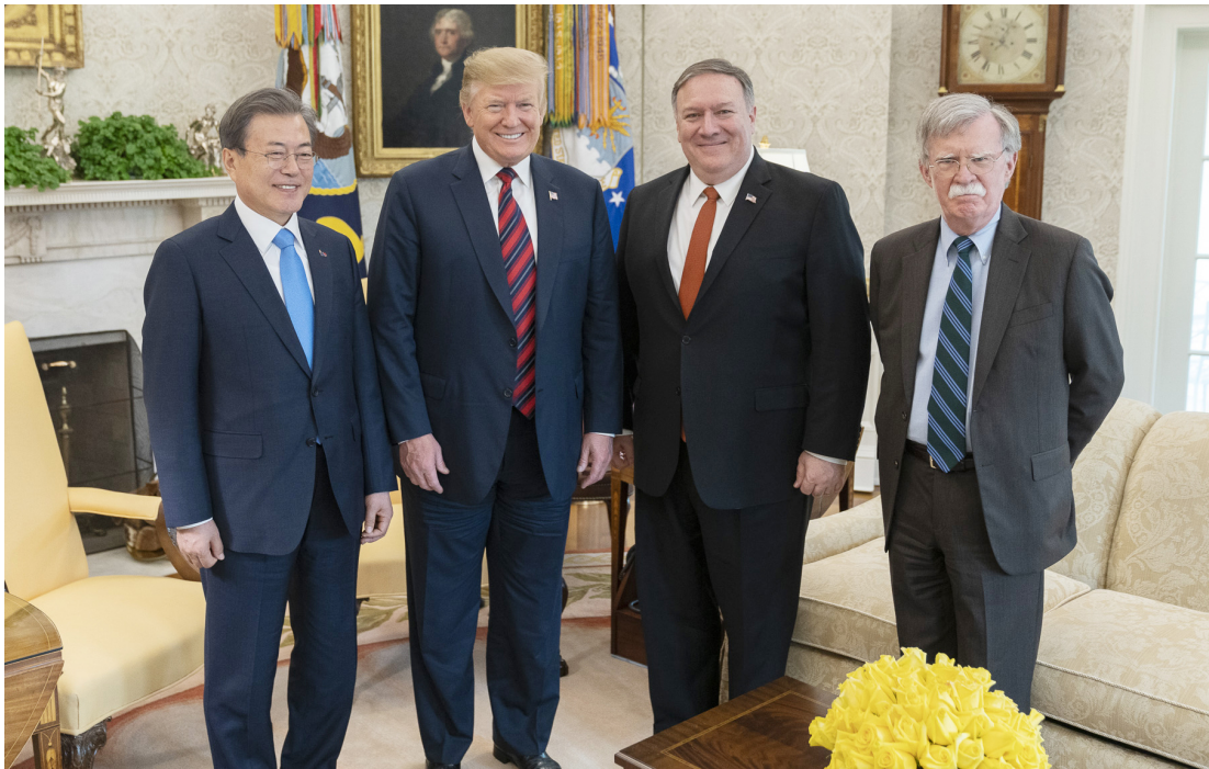
Trump's meeting with South Korean President Moon Jae-in, April 11, 2019, considered what to do next about North Korea's nuclear weapons and ballistic missile programs after two failed summits with Kim Jong-un.