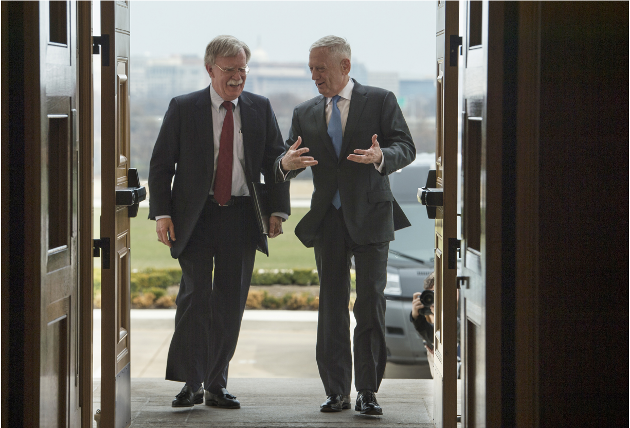
After greeting me at the Pentagon's ceremonial entrance, Mattis and I enter the building for our first meeting, on March 29, 2018, ten days before my official start as National Security Advisor.