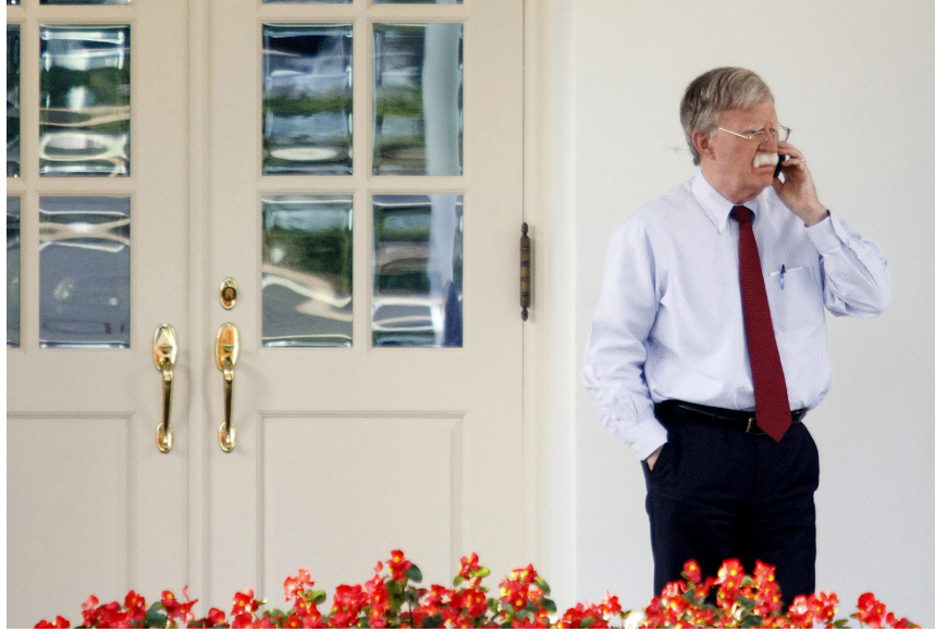
Outside the West Wing on September 10, 2019, explaining to my daughter on my personal cell (normally kept in a secure box during the work day) that I am about to resign.