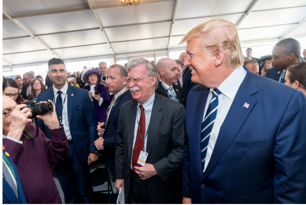
Trump meets with US service members, veterans, and their families at the UK celebration of the 75th anniversary of launching D-Day, on June 5, 2019, at Portsmouth, England, from which much of the Allied invasion armada sailed.