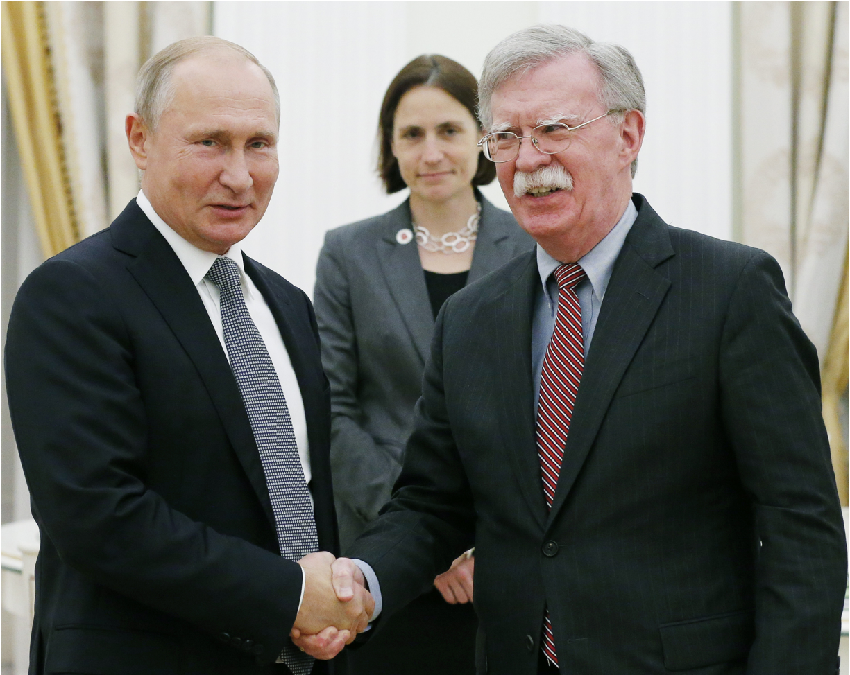
Russian President Vladimir Putin welcomes me to our second 2018 meeting in Moscow's Kremlin, on October 23, where, among other things, Putin joked that Russia would sell weapons to Saudi Arabia if the US did not. Fiona Hill, NSC Senior Director for Europe and Russia, looks on.