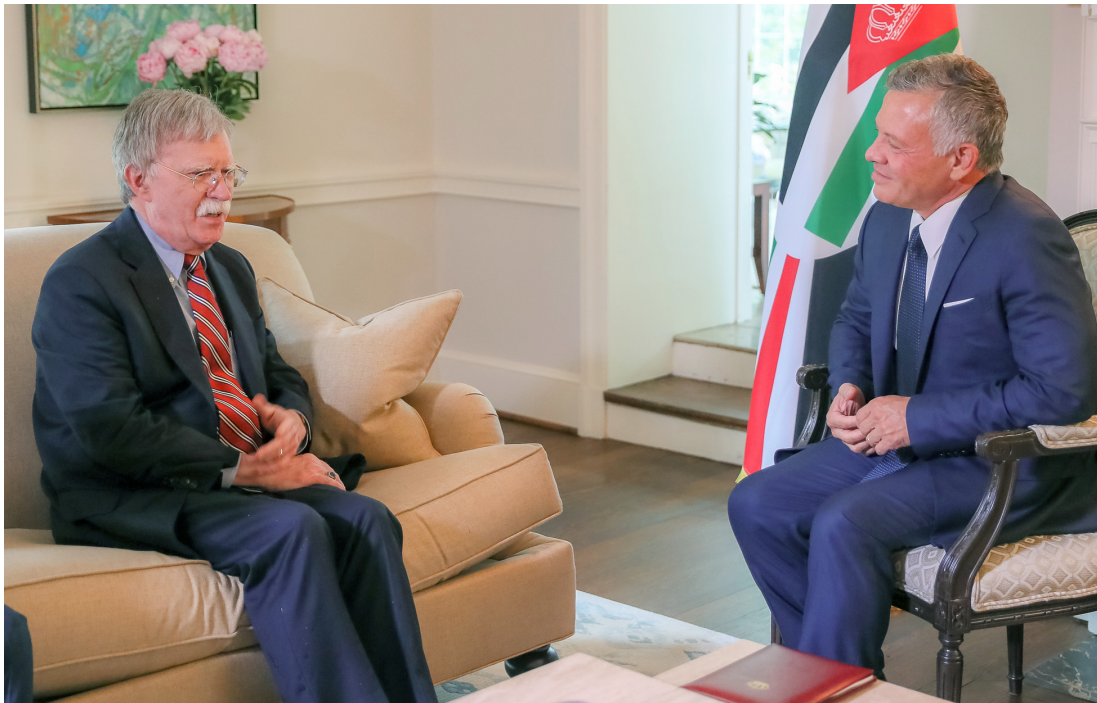
I met with King Abdullah at the residence of Jordan's Ambassador to Washington on June 22, 2018, just before the King's meeting with Trump to discuss the continuing crisis in Syria, and Iran's support for the Assad regime.