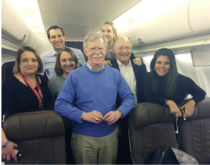
Always an experience: reporters accompanying me on one of several Middle East trips on board our military aircraft, March 23, 2019.