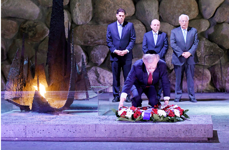
Laying a wreath at the Yad Vashem Holocaust memorial in Jerusalem, Israel, on August 21, 2018, a traditional stop for high-level visitors.