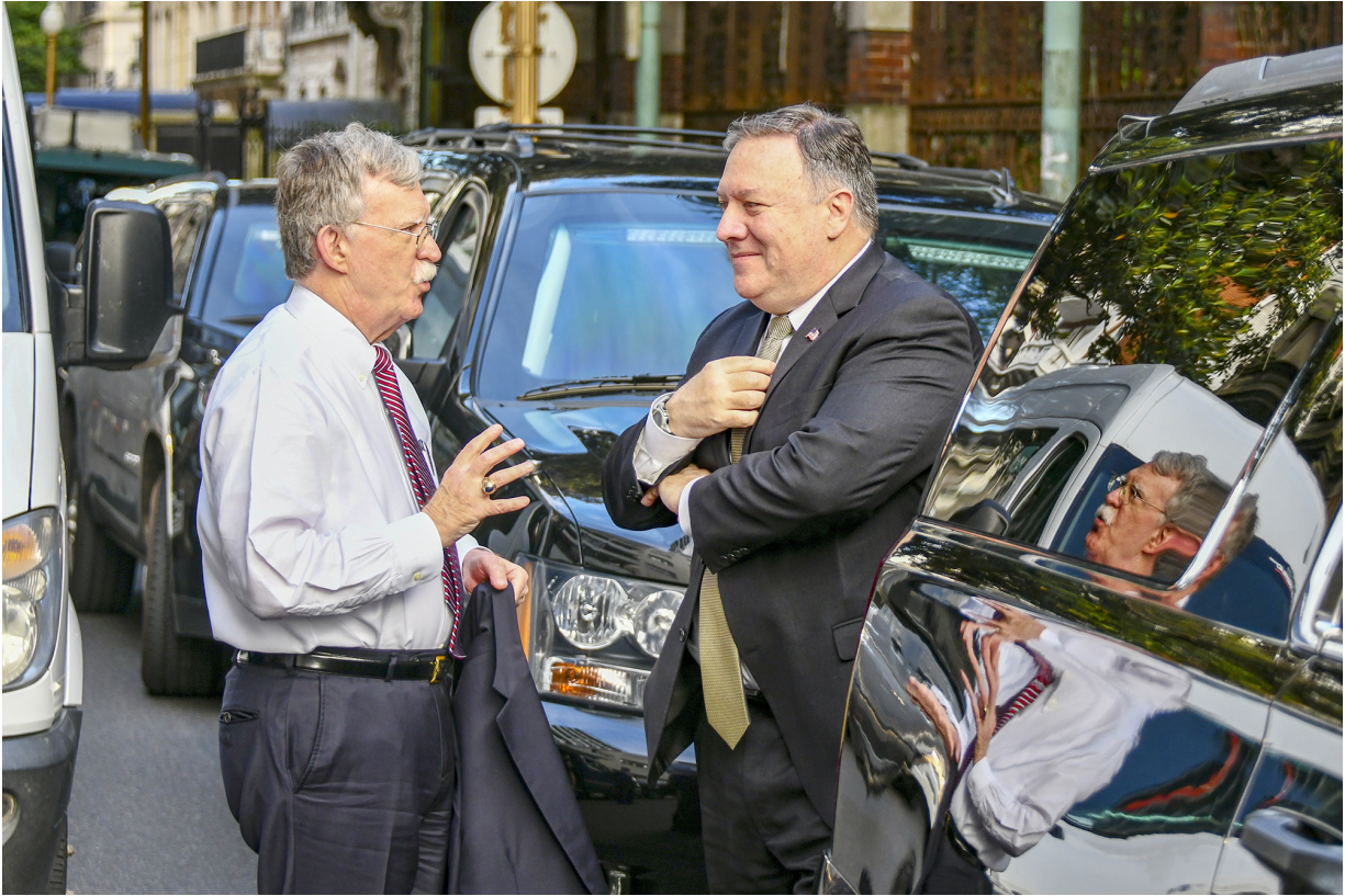
Pompeo and I speak while waiting for Trump, typically late, to join the G20 meetings in Buenos Aires, Argentina, on November 30, 2018, as relations with Russia chilled after the seizure of Ukrainian ships in the Kerch Strait.